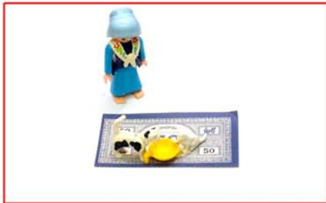
1. Irresponsible feeder feeds without sterilising