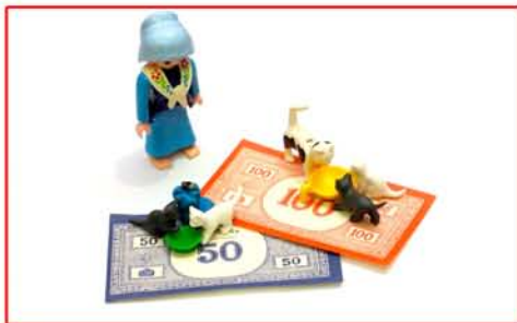
3. and keep increasing...