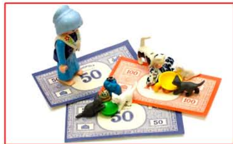
4. and keep increasing...

Sterilise if you feed. It saves dollars and makes sense.