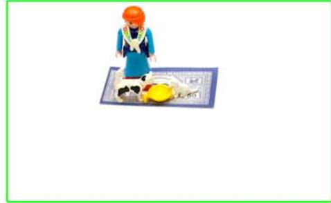
2. Population and food costs remain stable over time