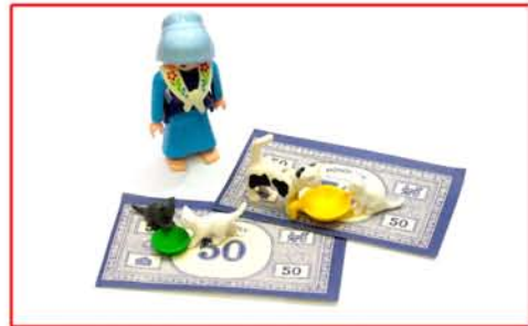
2. Population and food costs start increasing