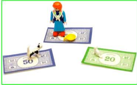
1. Responsible caregiver sterilises both cats